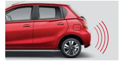
Reverse Parking Sensor

SMART We know what you need in your car. And have designed it accordingly.