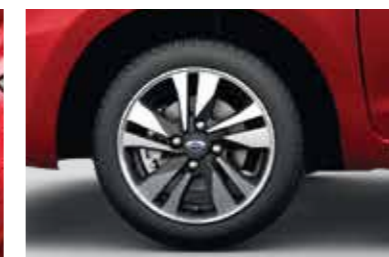
Diamond-Cut R14 Alloys