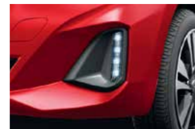
Stylish LED DRLs

STYLE Turn heads on the road with a dazzling range of new generation features.