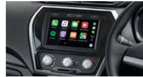
17.64cm (7.0) Touchscreen with Advanced Infotainment System

SMART We know what you need in your car. And have designed it accordingly.