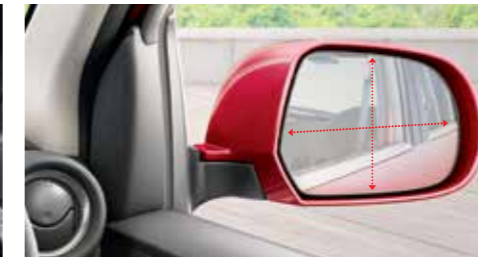
Electric Adjustable ORVMs