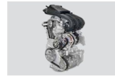
Powerful 1.2L Engine

SURE Tried and tested Japanese Engineering.