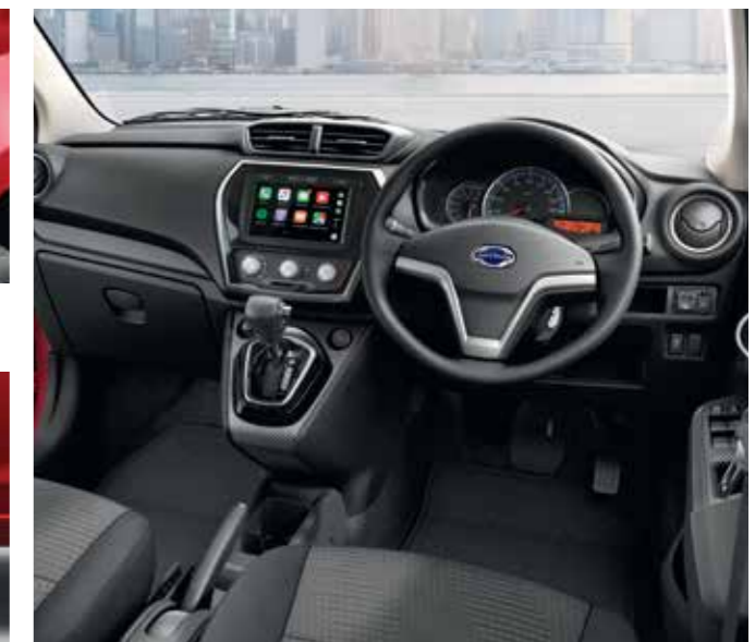
All-Black Premium Interiors