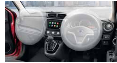
Dual Front Airbags

SAFE Make every drive a safe drive. The Datsun GO CVT is packed with next-generation safety features.