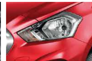
Headlamps with Follow-Me-Home Feature