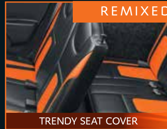
TRENDY SEAT COVER