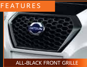
ALL-BLACK FRONT GRILLE