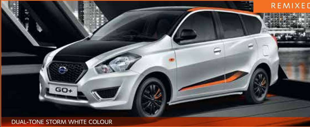
DUAL-TONE STORM WHITE COLOUR