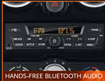
HANDS-FREE BLUETOOTH AUDIO