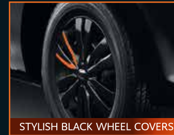
STYLISH BLACK WHEEL COVERS