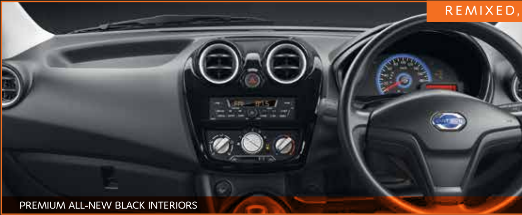
PREMIUM ALL-NEW BLACK INTERIORS