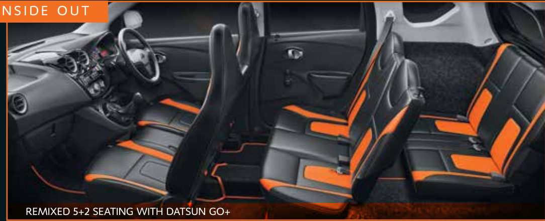
REMIXED 5+2 SEATING WITH DATSUN GO+