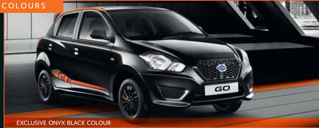
EXCLUSIVE ONYX BLACK COLOUR