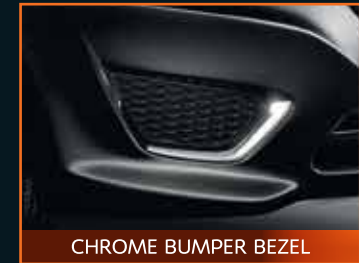
CHROME BUMPER BEZEL